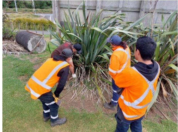
Flax cutting Heritage Bypass