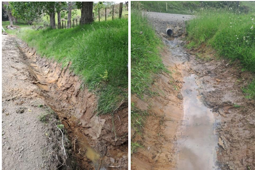
Drainage works Wharepunga Rd