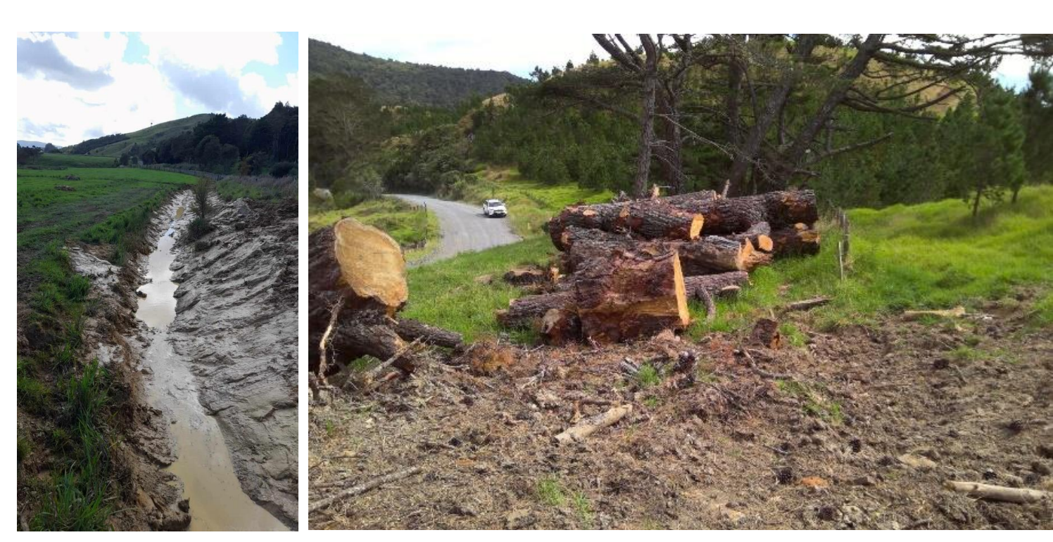
Rangiahua Road / Greenacres Road