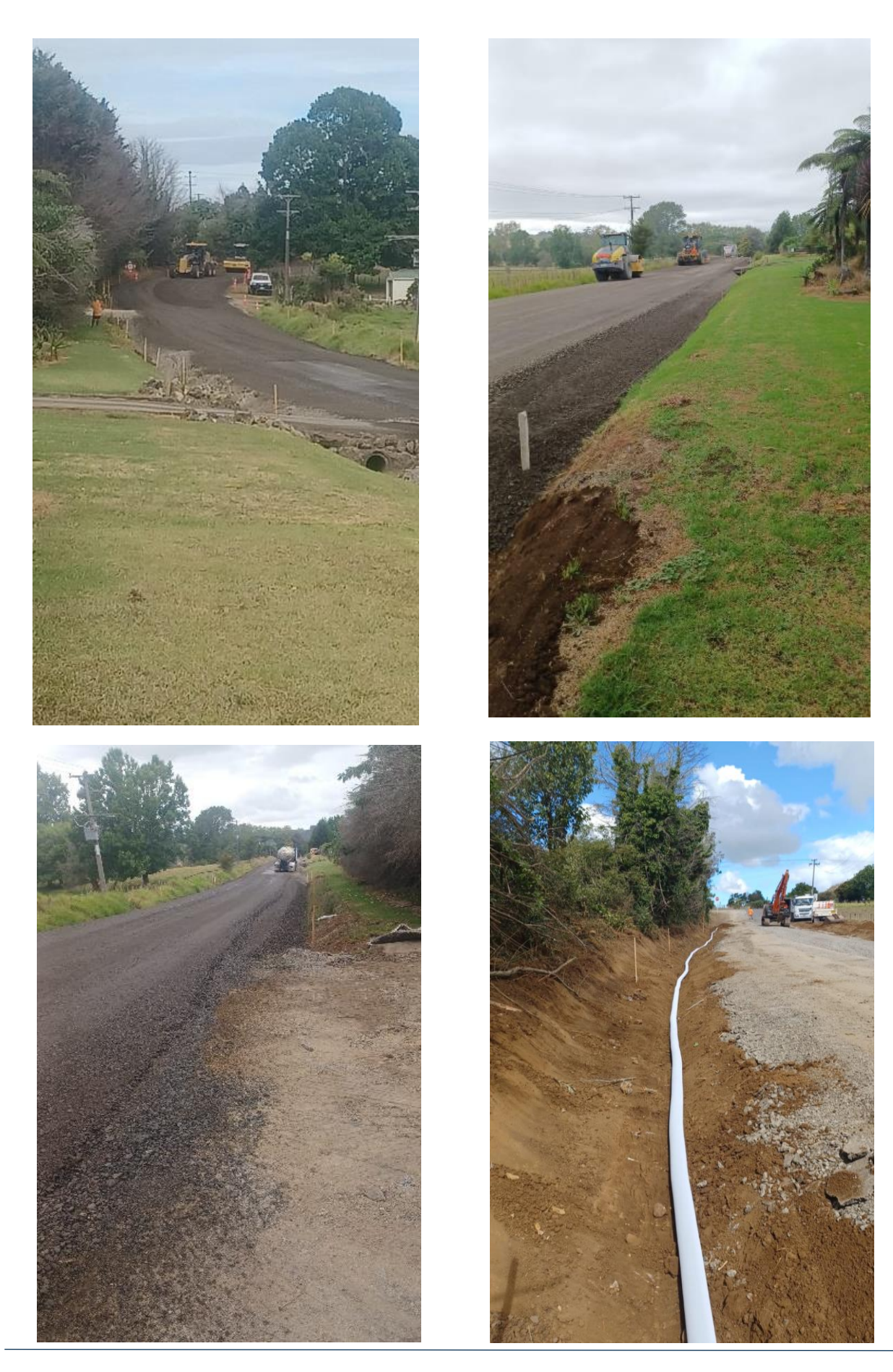
Ventia - FNDC South 7/18/101 Monthly Report - February 2023