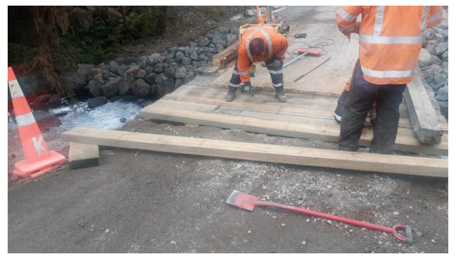
Cumber Road Bridge Repair

Our signs crew carried out some emergency repairs on Cumber Road bridge after it was hit by a truck, causing significant damage to the brdge structure.