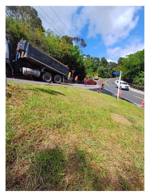
Settlers Way / Sullivans Road

We were lucky enough to be able to time the Waipapa Landing Bridge repair closure with the reseal of the bridge deck surface, and an Asphalt rehabilitation. A huge collaborative effort between Steve Bowling Contractors, Tarmac, FNDC, T8 and Ventia allowing us to all work together to achieve the best results, and even finish ahead of schedule. A huge thanks to the team at Steve Bowling Contractors allowing us to utilise the same site closure. Teamwork makes the dream work!