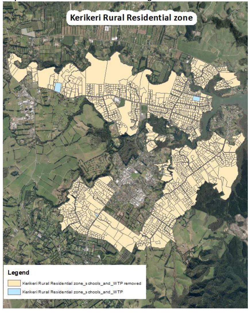
Map 3: Rural Residential zone surrounding Kerikeri