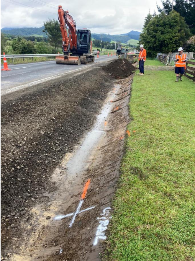
Kaitaia to Ahipara Safety Improvements