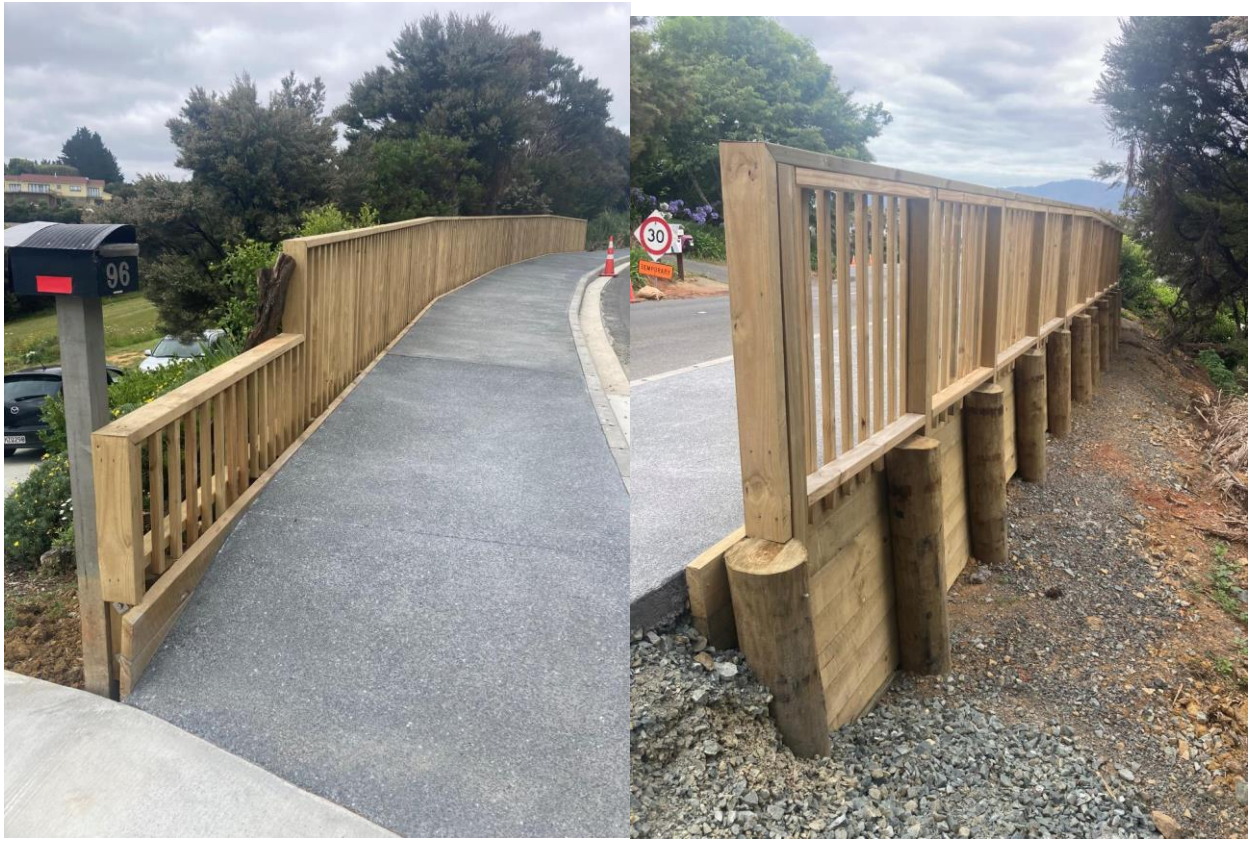
Cable Bay Block Rd New Retaining Wall and Footpath