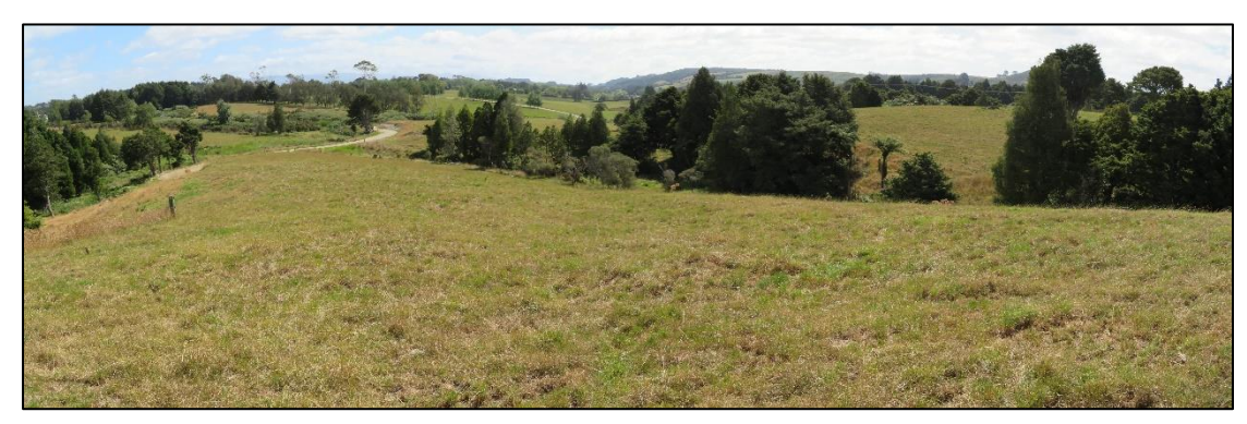
Figure 3: General image of the property viewed from the northeast (Prince 2019).

No archaeological features or evidence that undetected archaeological sites exist were identified during the current inspection.