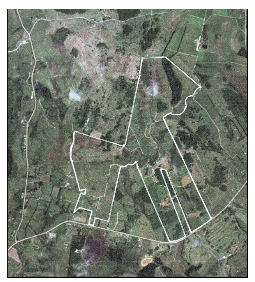
Figure 1: Far North Holdings proposed Ngawha Innovation and Enterprise property.