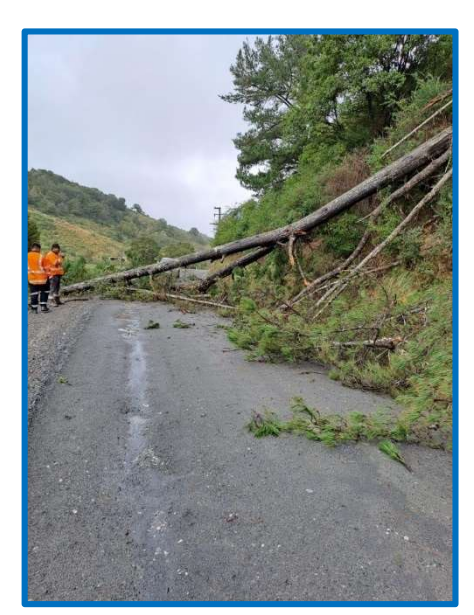
Left to right -Cumber Rd bridge wash out, Punakitere Loop Rd, Matawaia-Maromaku Rd