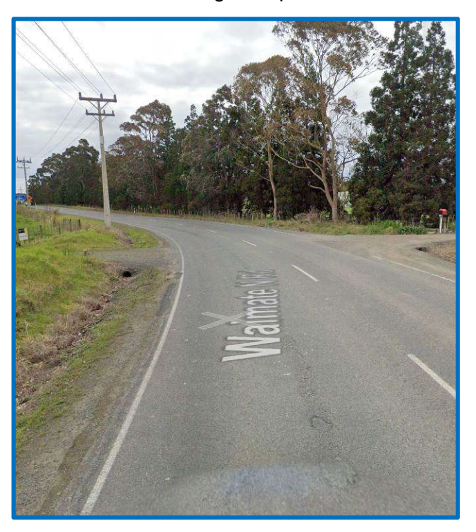
Before - Note edge line position.