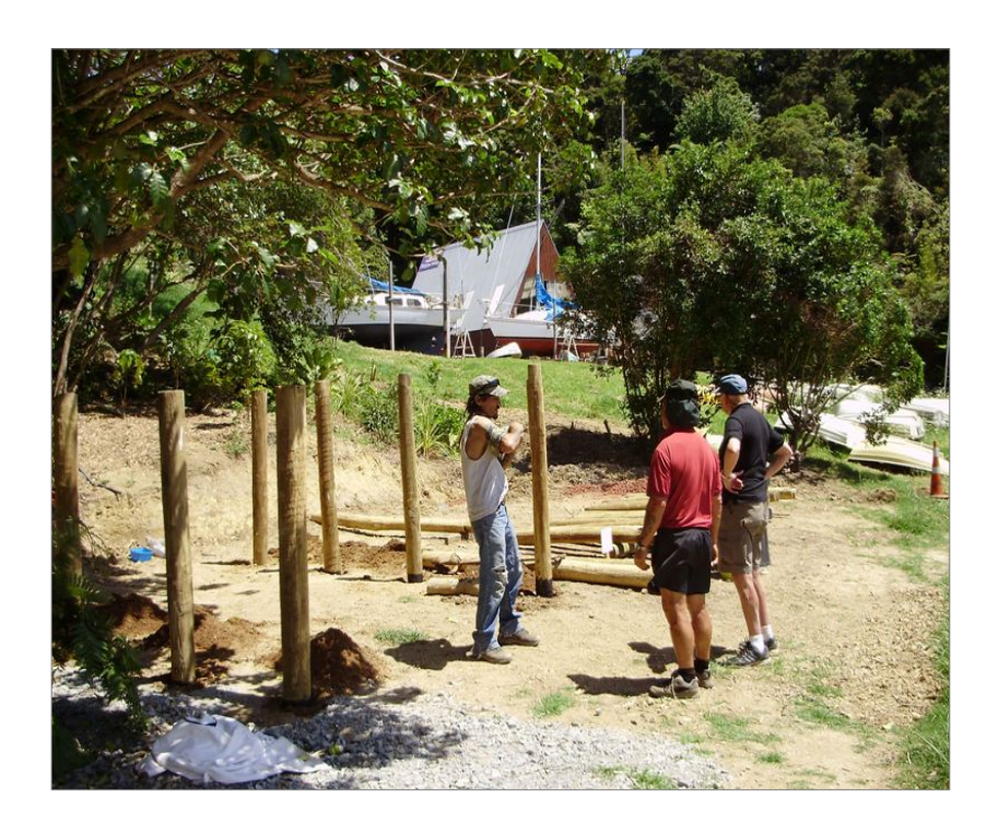
Figure 2: Local iwi involved in building the dinghy racks as a community project