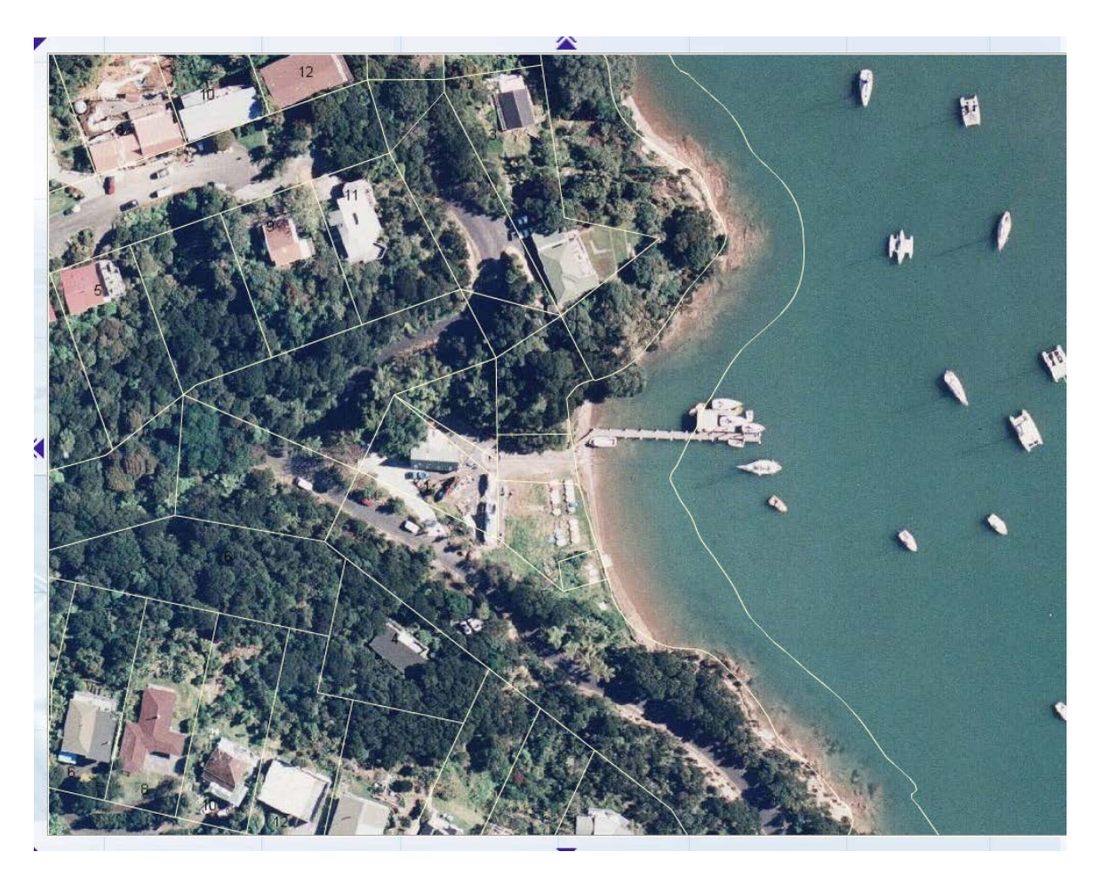
Figure 1: Aerial photograph Walls Bay Reserve