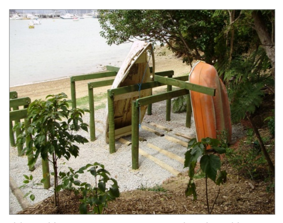
Figure 4: Above dinghies taking up reserve space and replaced by community built vertical racks