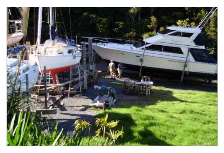
Figure 3: The boat yard operations has potential to dominant the esplanade reserve

Objective 3 To maintain and where possible enhance the natural features of the Reserve