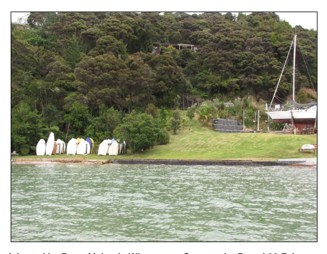
Adopted by Bay of Islands Whangaroa Community Board 20 February And the Council 21 February 2013 Reviewed October 2014