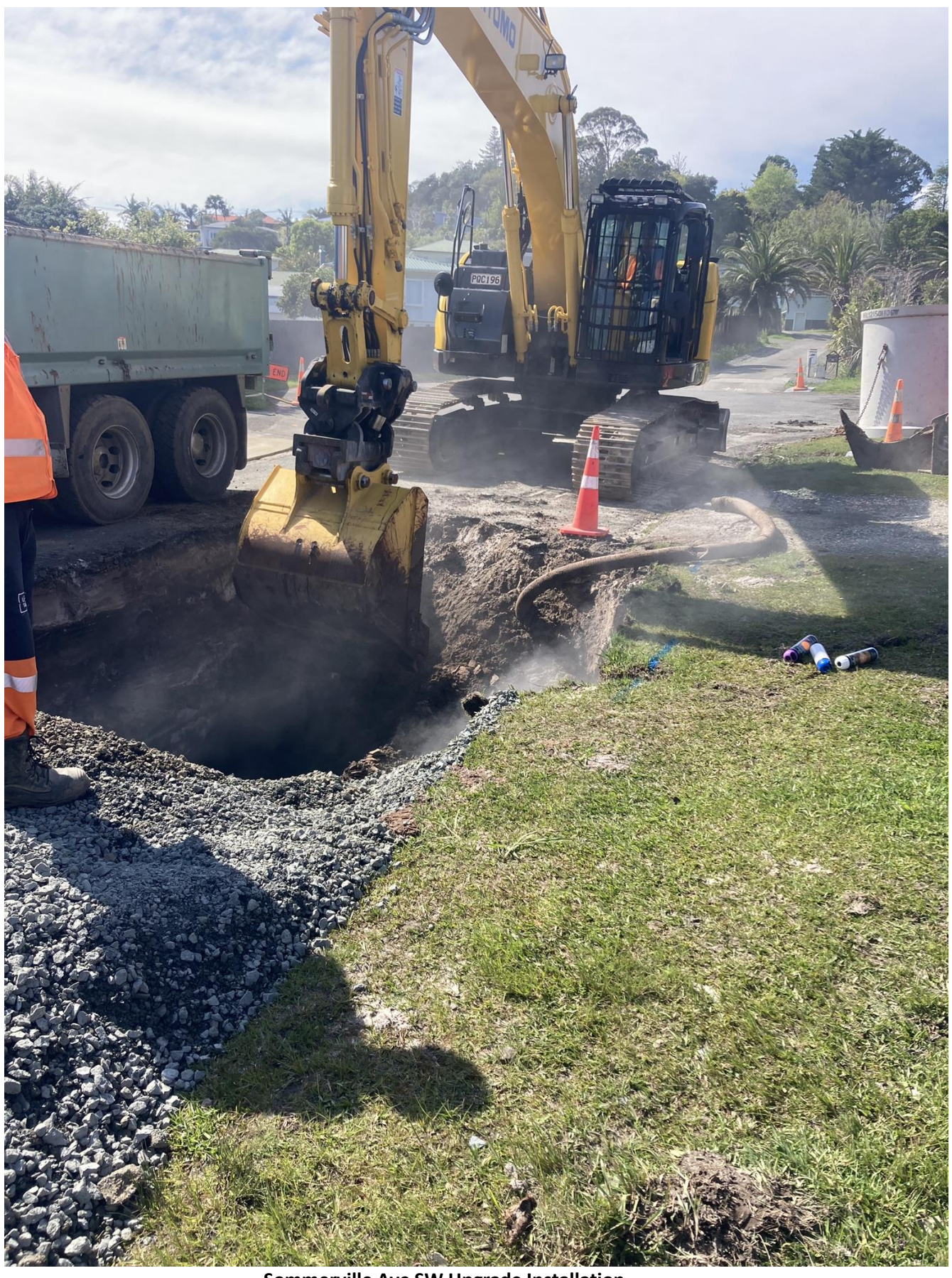
Sommerville Ave SW Upgrade Installation