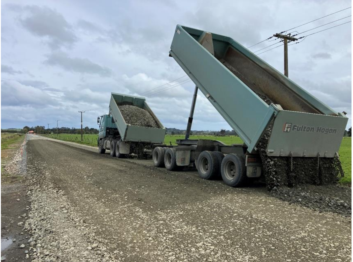
Gill Rd Pavement Rehabilitation Overlay