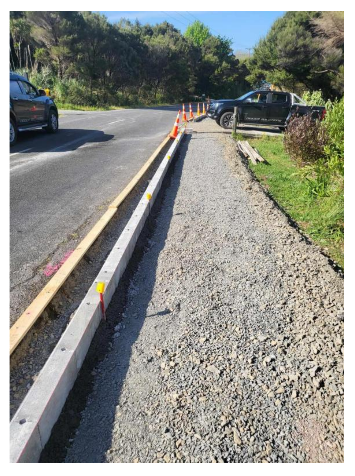
Cable Bay Block Road New Footpath Prep