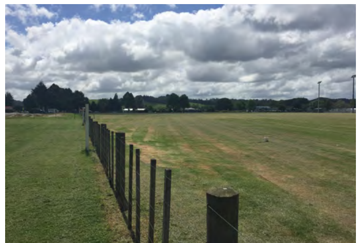
6. Perimeter fencing