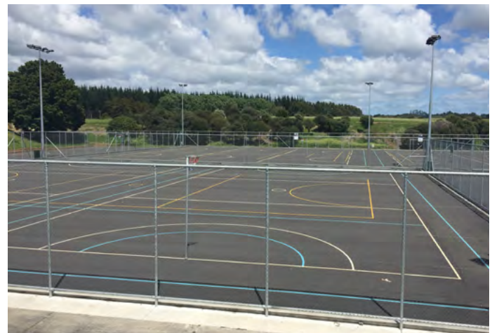
4. Netball Courts