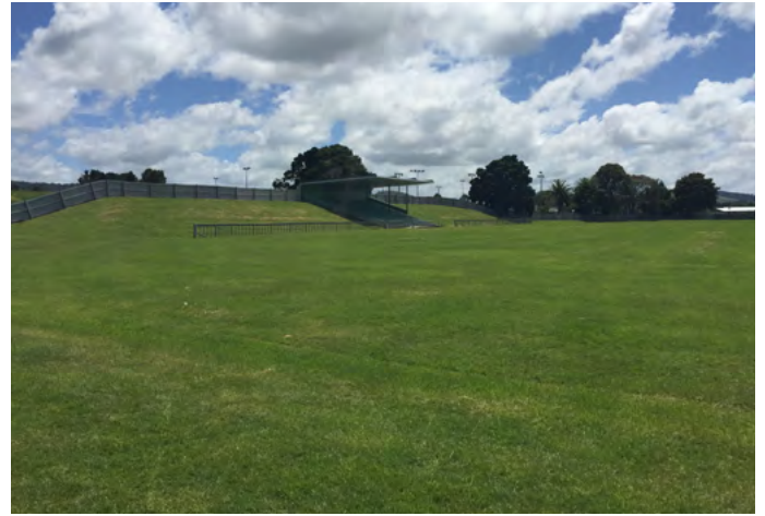
2. Premier Rugby ground and grandstand