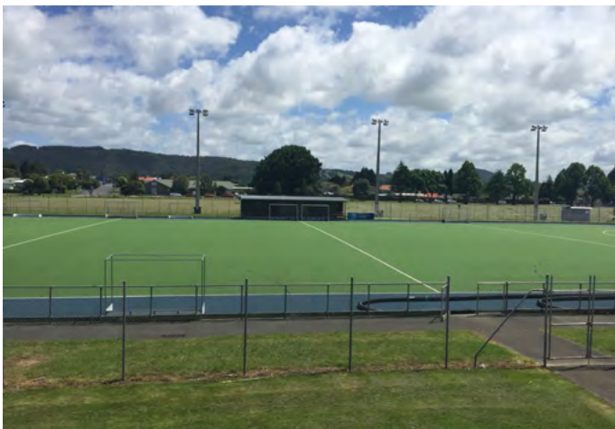
3. Hockey turf including lighting and fencing