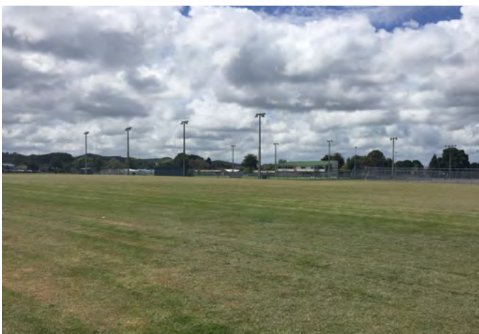
5. View of Lindvart Park from Recreation Road