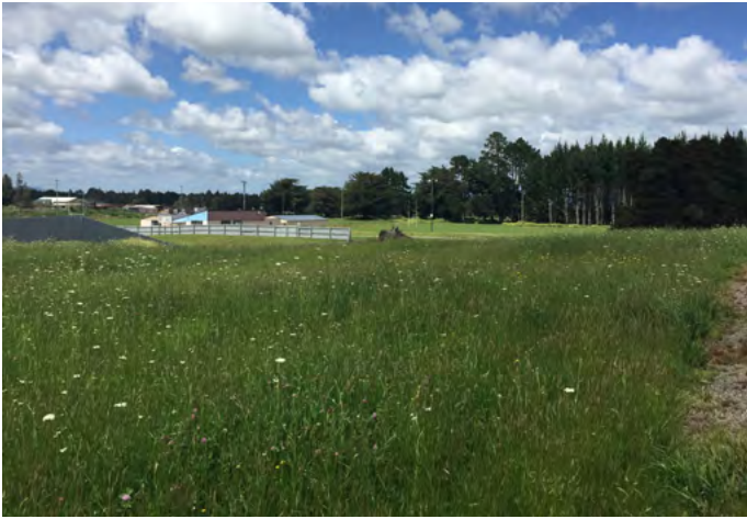
1. Former landfill site looking towards Rugby park