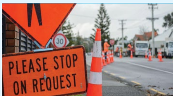
A short detour on SH11 is in place in Paihia until the end of April.

Northbound traffic travelling from Ōpua to Paihia is being directed to detour along MacMurray Road and Kings Road as drainage and road improvement works continue on a section of State Highway 11.