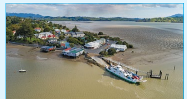
The public is encouraged to keep reporting water leaks to the council.

Water restrictions for the Ōpononi-Ōmāpere and Ōmanaia-Rāwene communities were reduced to Level 1 last week, marking the end of all remaining restrictions across the Far North.