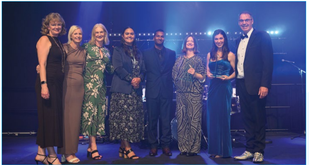
Two FNDC projects earned national recognition at the awards, with Te Pātukurea Kerikeri Waipapa Spatial Plan getting the award nod twice.

Staff worked closely with a Hapū Rōpū Governance Group representing Ngāpuhi hapū, Far North communities and partner organisations.