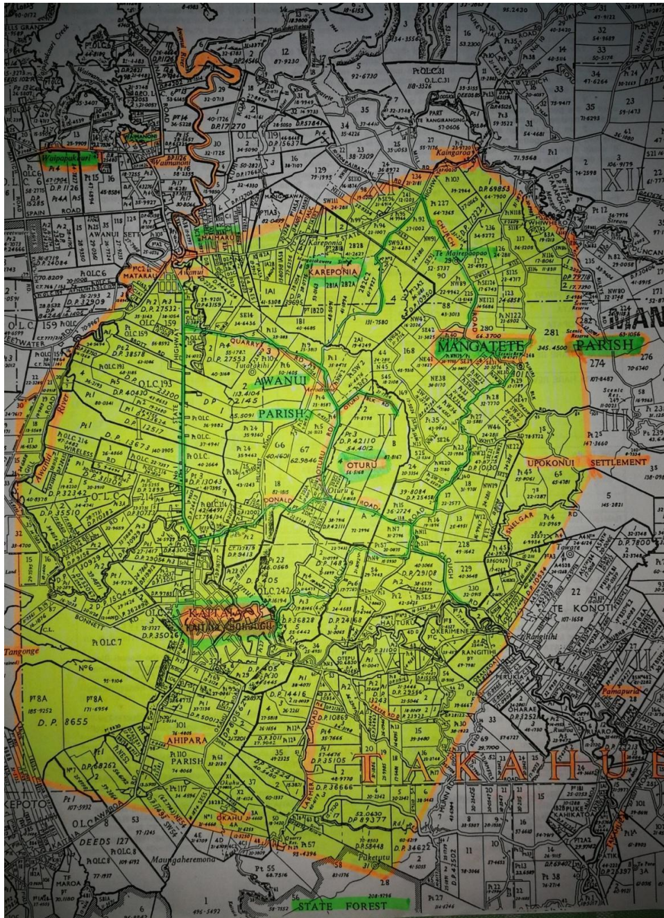
Figure 1: Te Mana Whenua Rohe o Ngai Tohianga