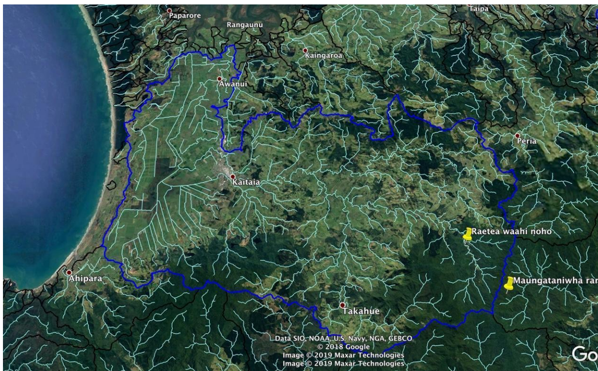
Figure 3: Awanui River Catchment and its tributaries draining North to Rangaunu Harbour