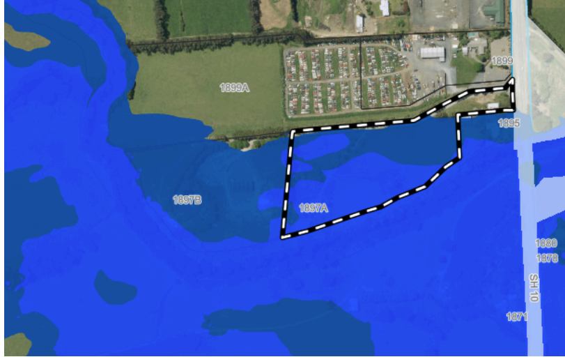
Figure 5 – Proposed Zoning