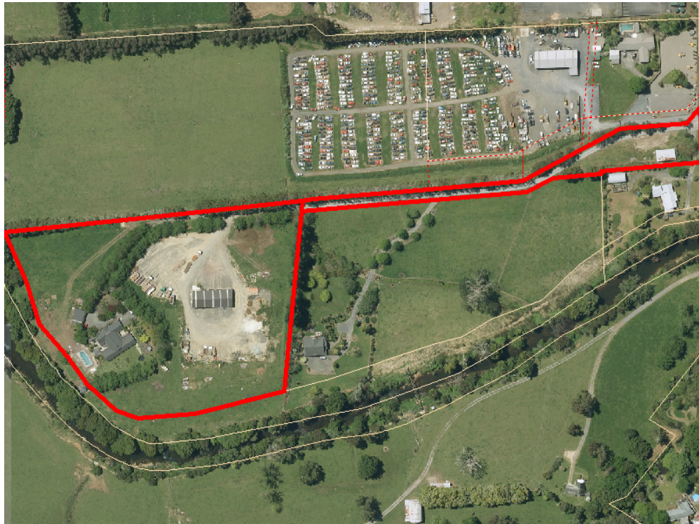
Figure 2 – Site RT: 87083