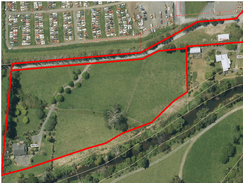
Figure 1 – Site RT: 87084

Plans showing the location of the land is provided at Figure 1 & 2 .