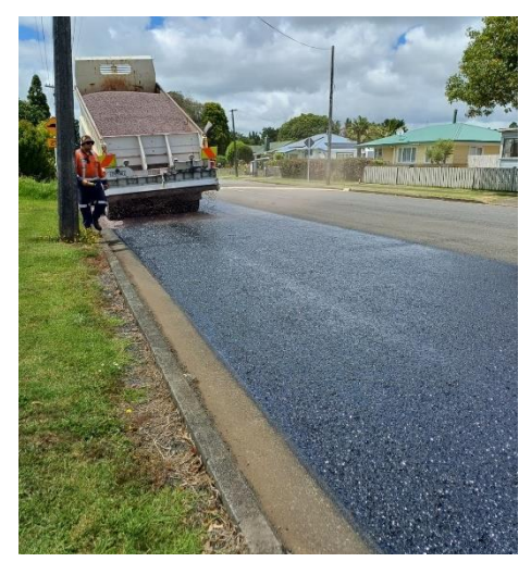
Bisset Road, Kaikohe