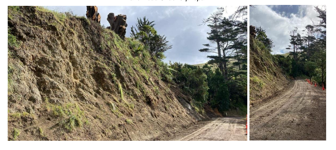
Waiotemarama Gorge Tree Removal