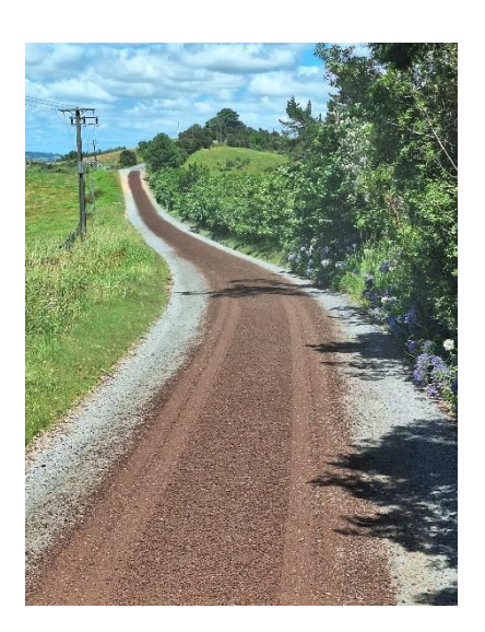
Waikuku Road / Redcliff's Road