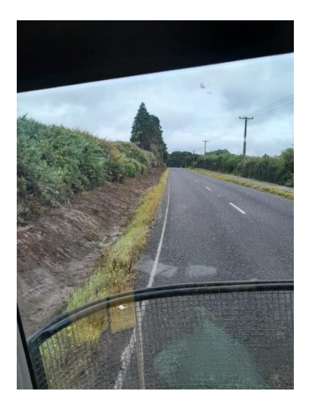
Drainage works Puketi Road / Thorpe Road