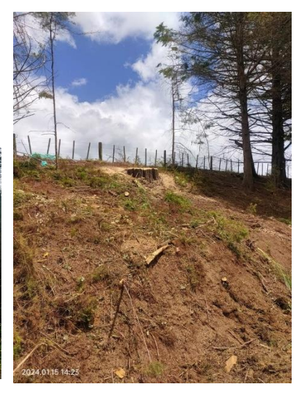
Te Ahu Ahu Road