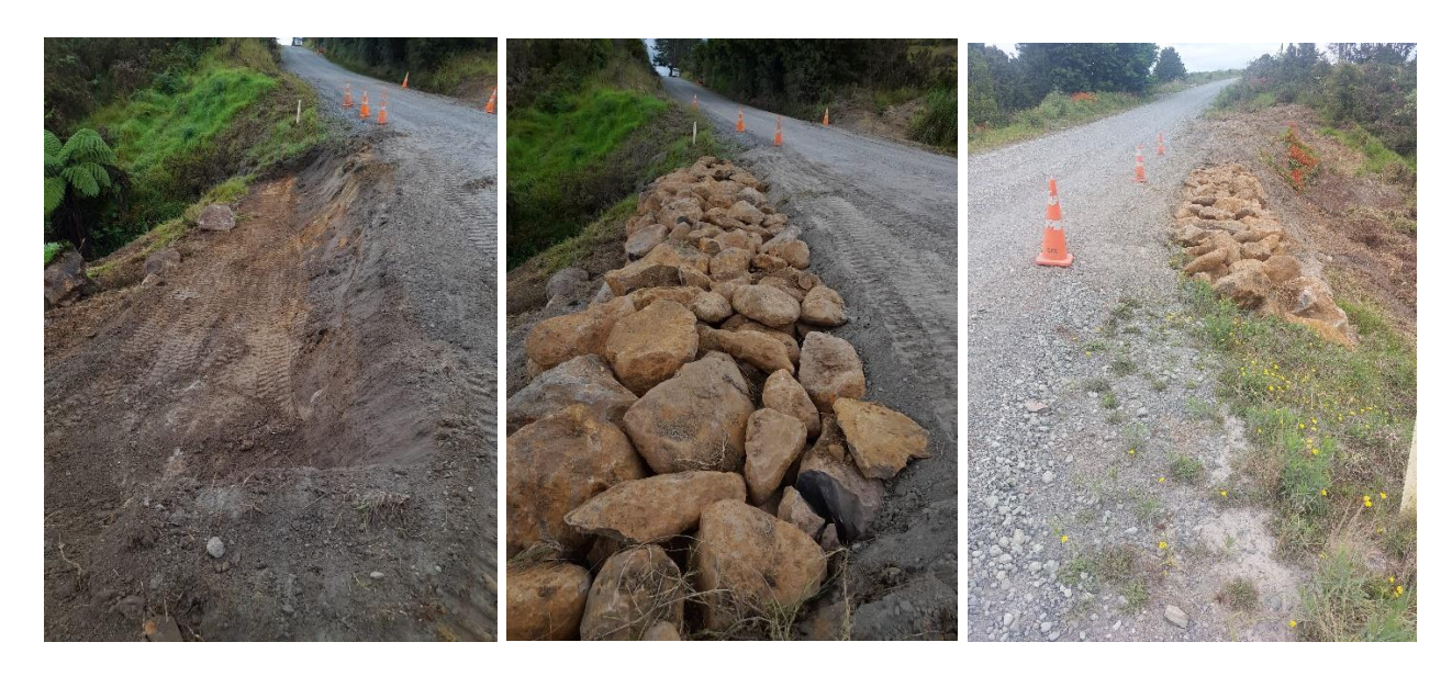
Lake Road Under slip repair

DCL and NTW caried on with the remaining tree works and completed another retaining wall on Lake Road.