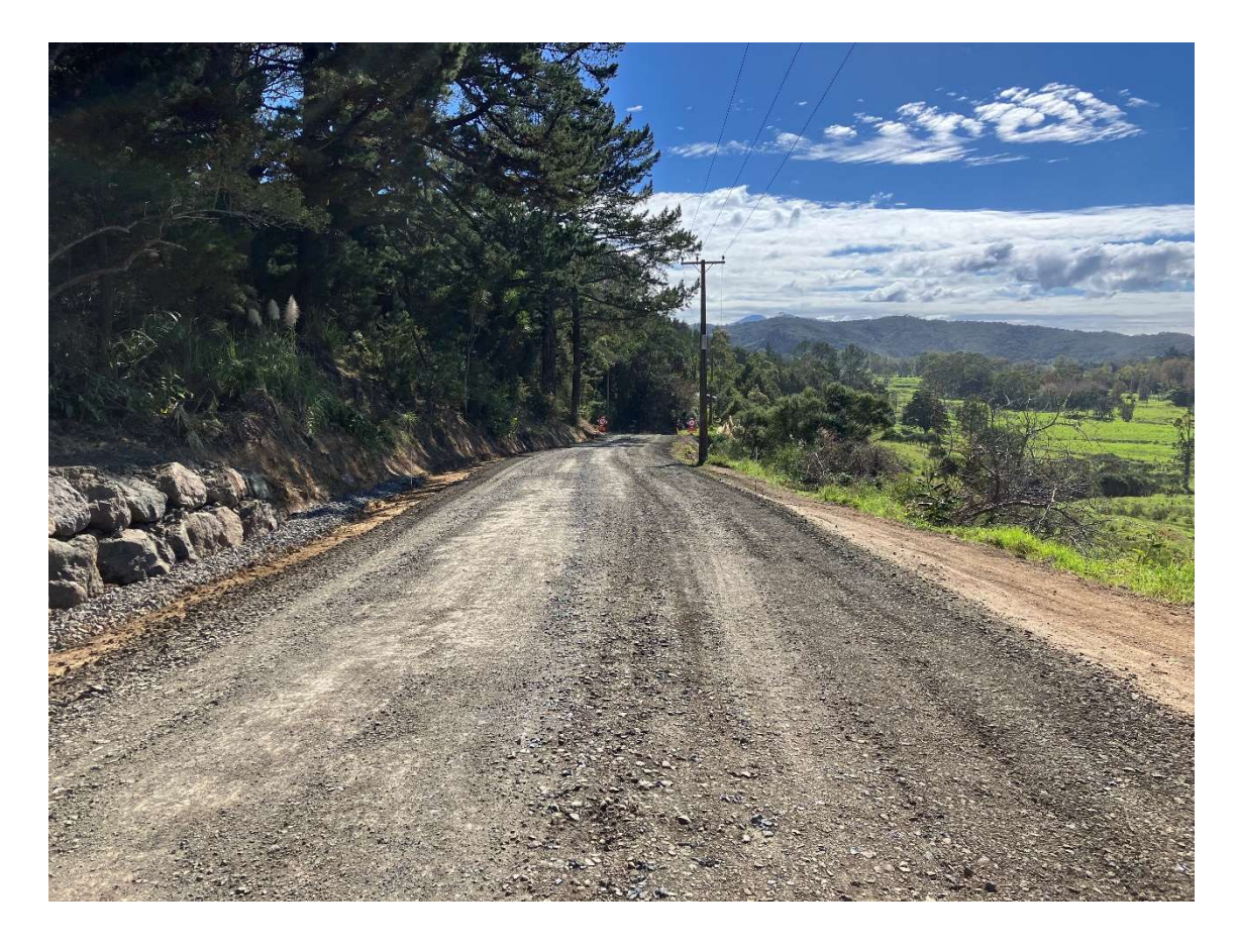
Pawarenga Road Seal Extension