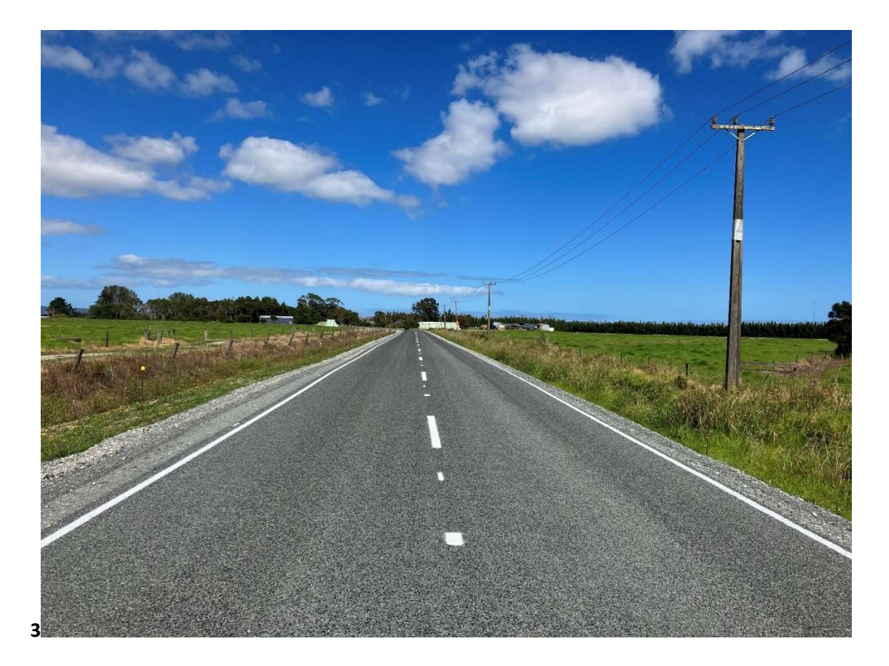
Gill Road Pavement Rehabilitation