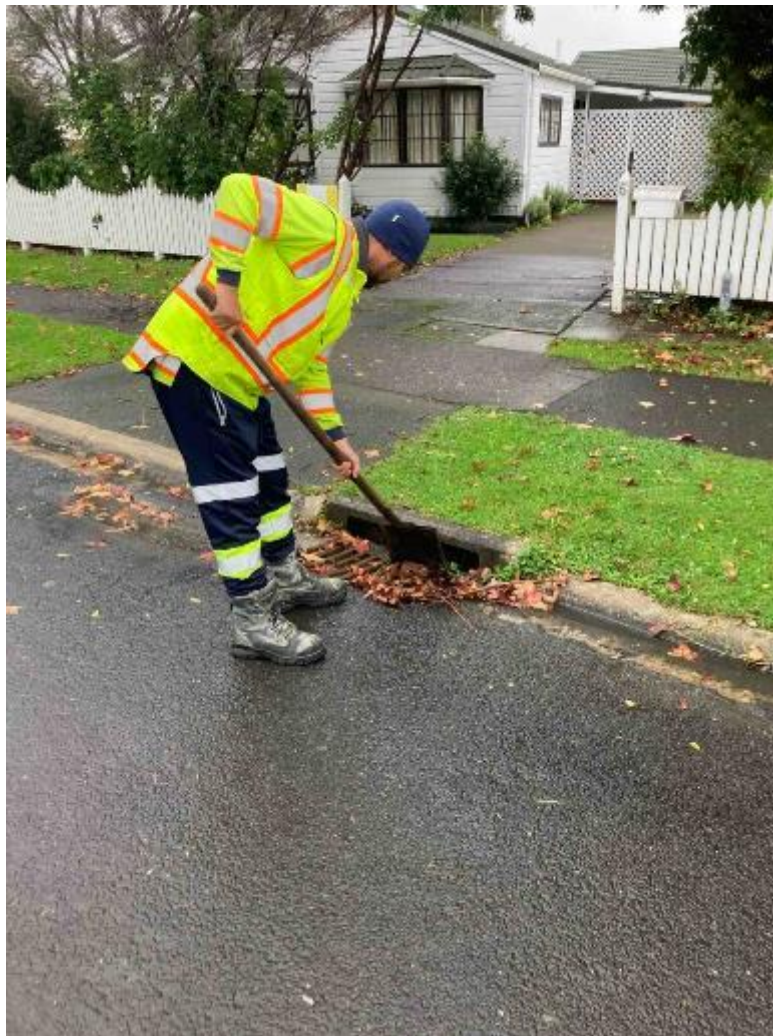
Redan Terrace, Kaitaia – Cesspit grate clearing