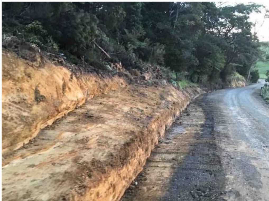
Peria Valley Road – Site benching

Find and fix crews have been completing lots of small jobs around the network – removing vegetation from around footpaths and signs, potholes (sealed and unsealed) and we are completing lots of grading when it's not wet out on the network. This month has also seen a large volume of unsealed metalling completed.