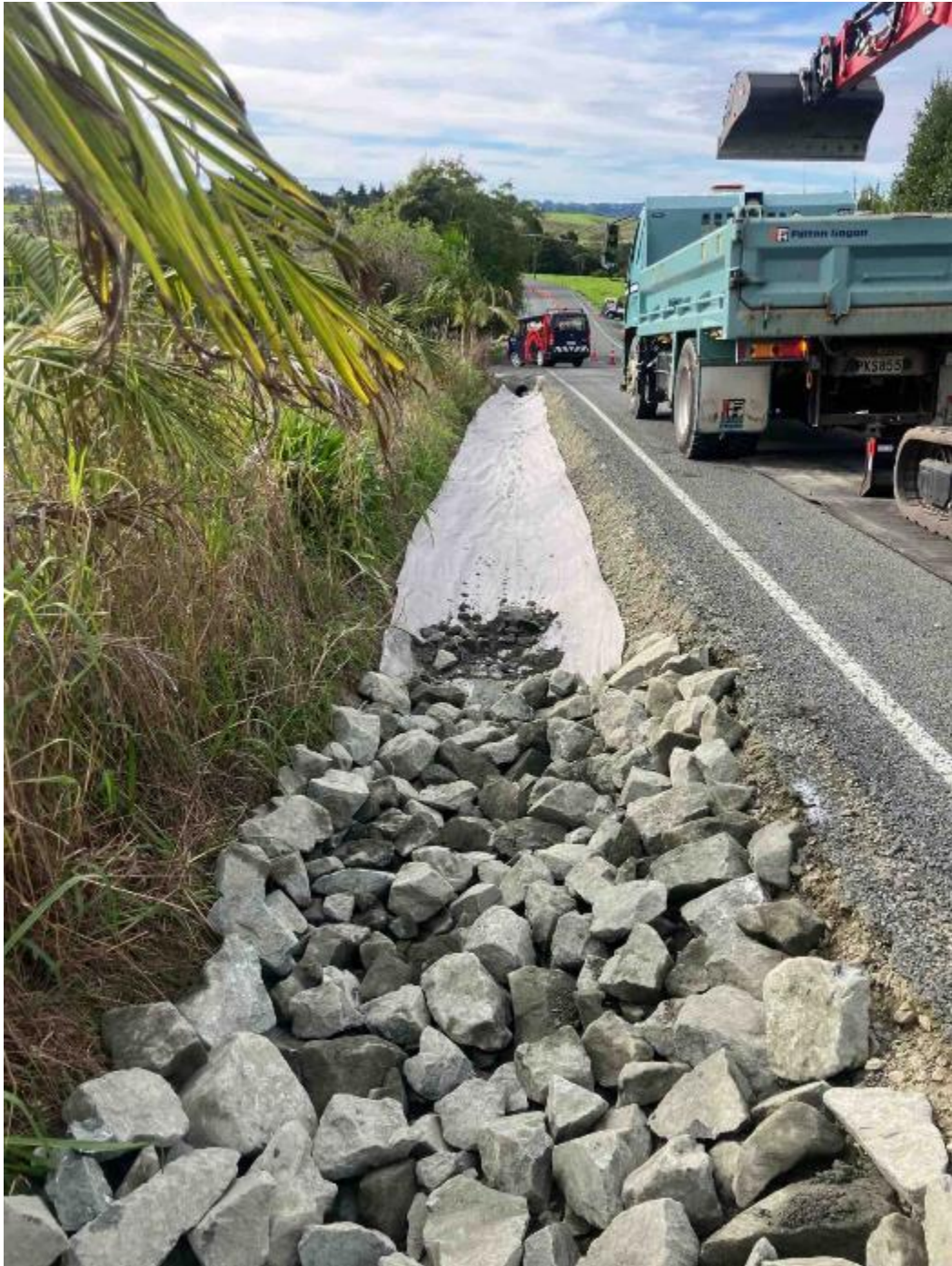
Larmer Rd Rehab – Riprap scour protection in progress