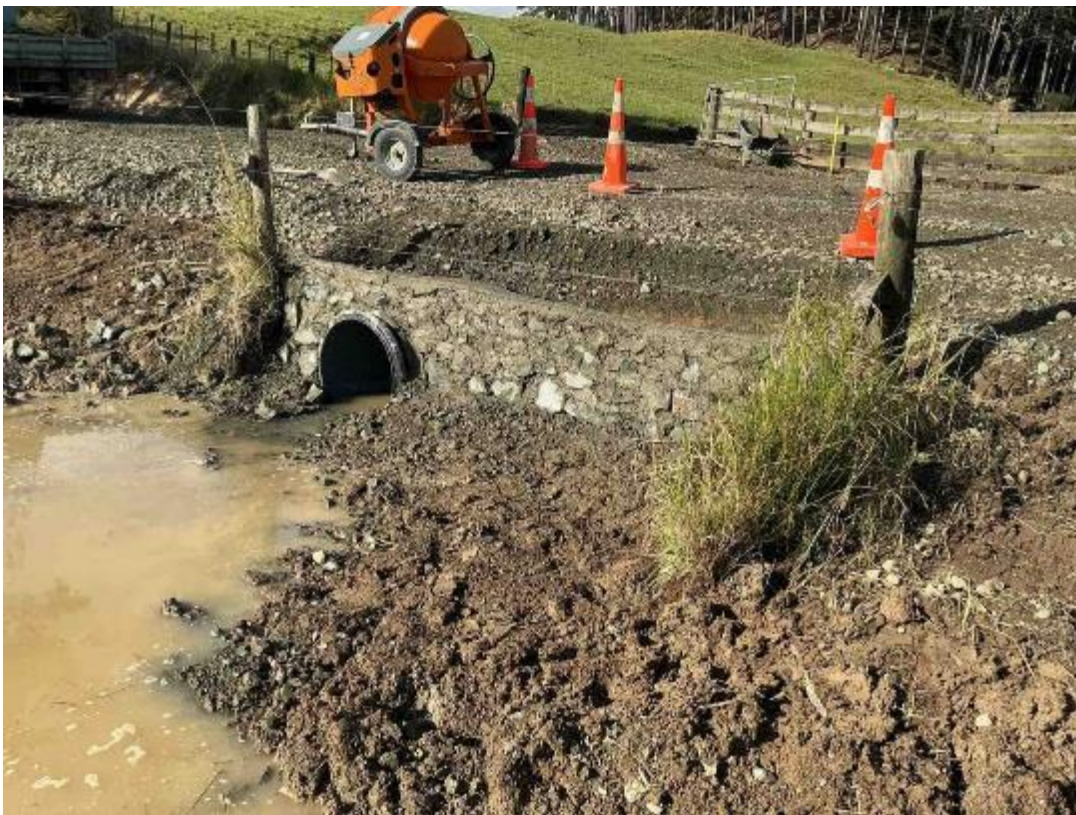
Peria Valley Rd, Kaitaia – Culvert Headwall