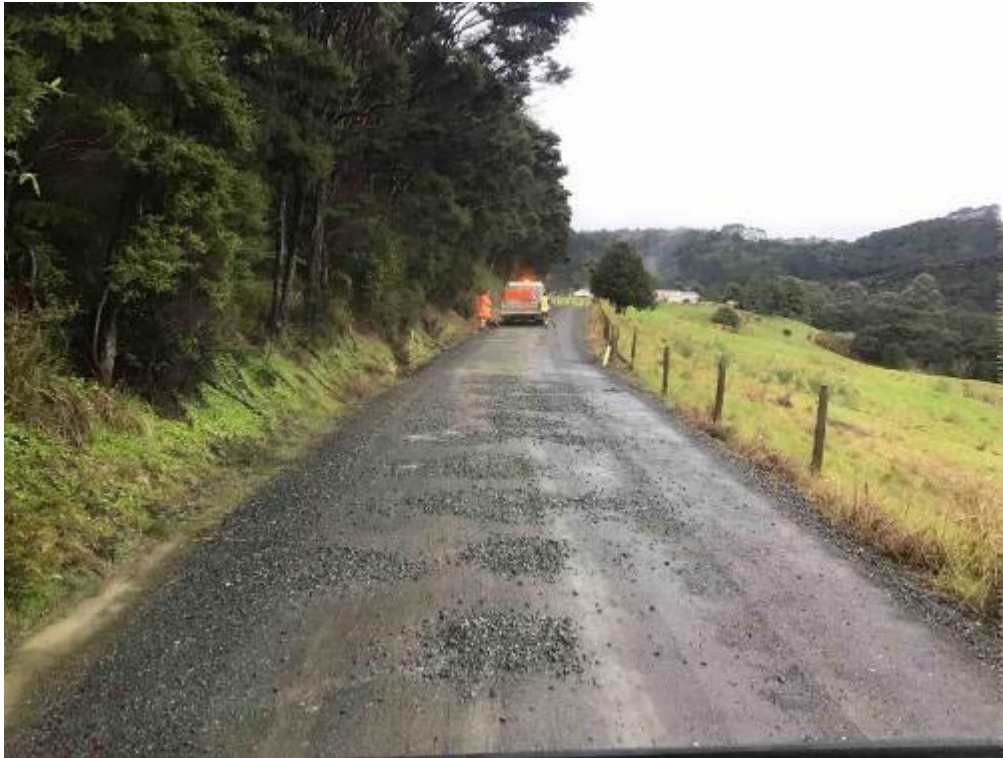
Parapara Rd – Unsealed Potholes