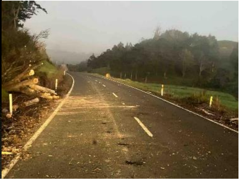
Kaitaia Awaroa Rd – Callout Fallen Tree