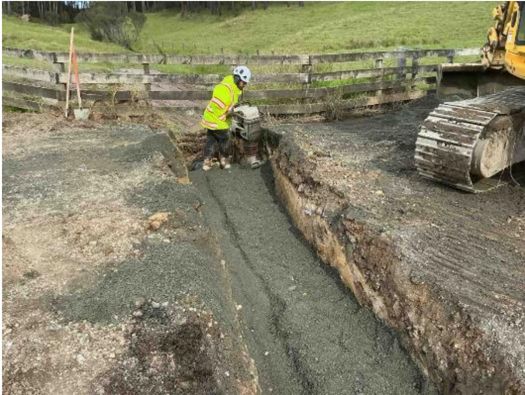
Peria Valley Rd, Kaitaia – Culvert Replacement In Progress