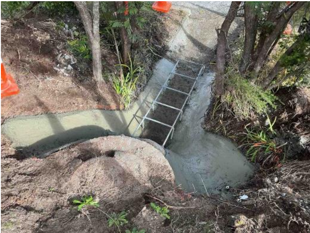
Bay Heights Rd – Drainage Improvements