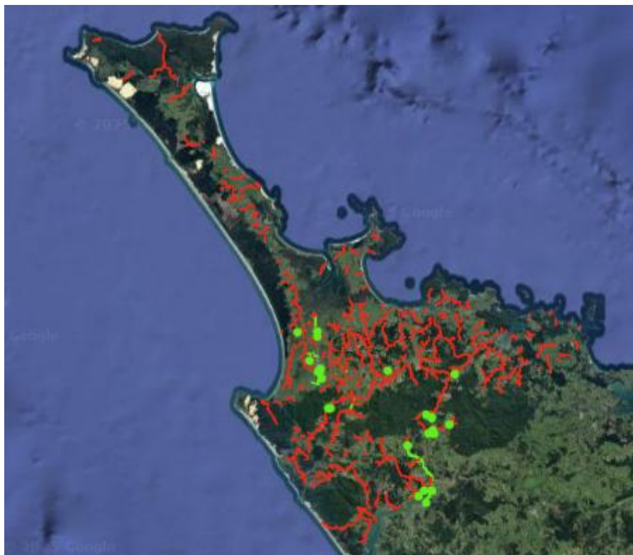
Figure 4: Locations of roadside mowing completed (highlighted green)