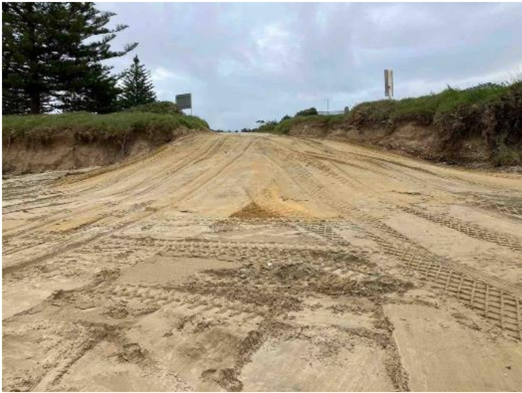
Ramp Rd – Grade Beach Access