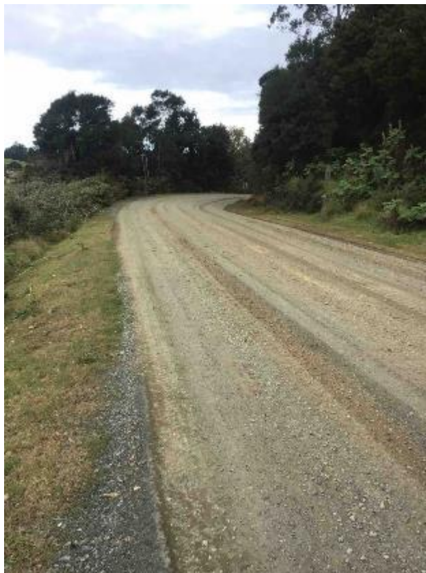
Kohumaru Rd - Grading