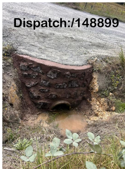
Pakaru / Matawaia-Maromaku Roads