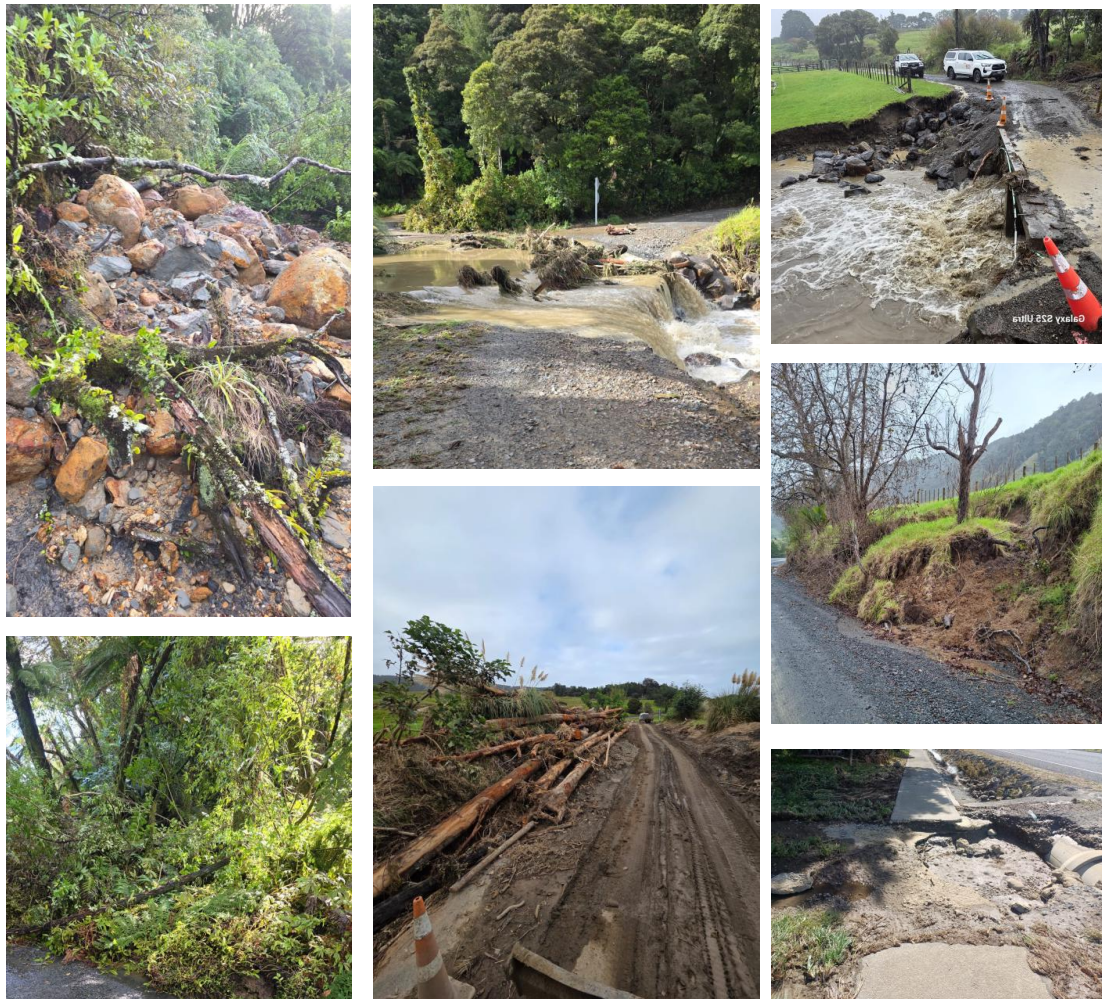
March Storm Damage (Western area of network)

Ventia – FNDC South 7/18/101 Monthly Report – March 2026