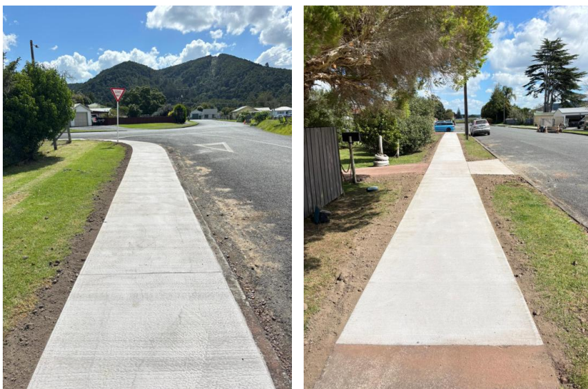
Factory Road / Sir William Hale Crescent