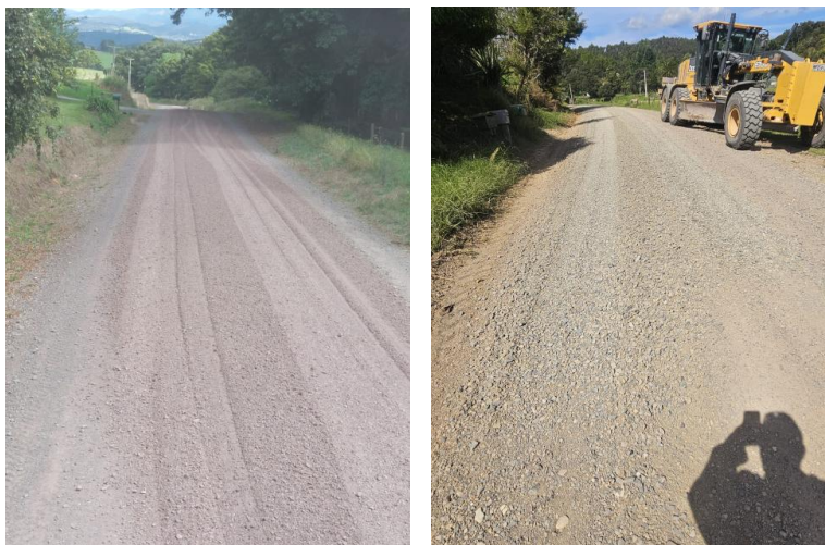
Hautapu Road / Waikare Road