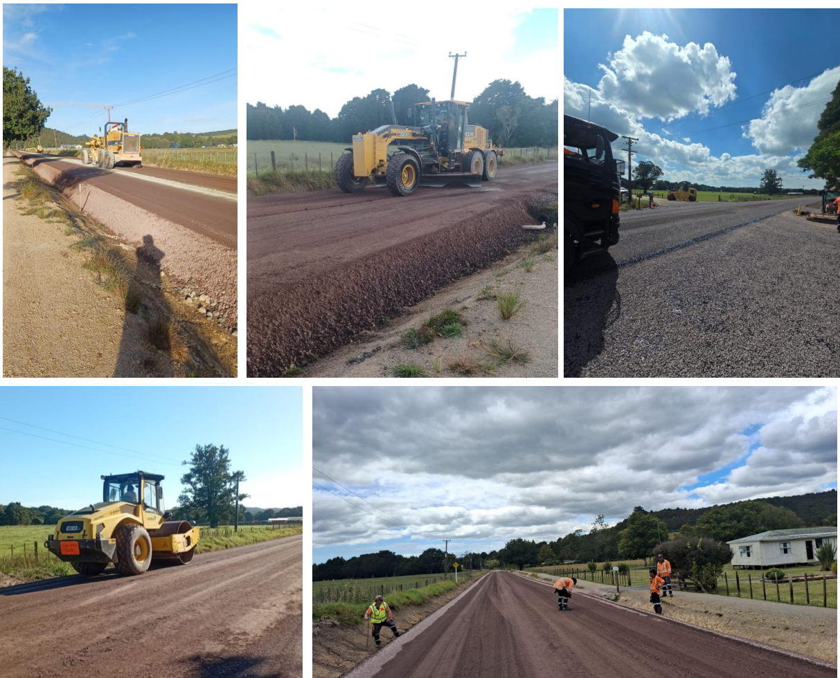
Ventia – FNDC South 7/18/101 Monthly Report – March 2026

The project has significantly improved the structural integrity and resilience of the road, resulting in a quality asset that will provide long-term benefits to both the local community.