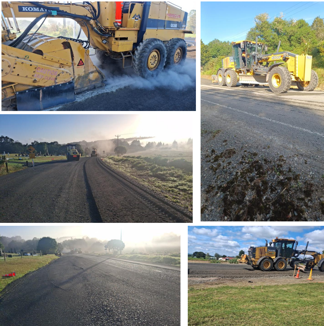
Ventia – FNDC South 7/18/101 Monthly Report – March 2026