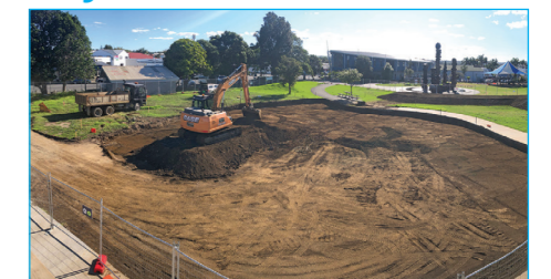
Work on the new Kerikeri Domain playground is due for completion in June.

Work on a new playground for Kerikeri Domain is now underway and is due for completion in June. The play area will include a flying fox, swings, slides, tunnels, a climbing wall, towers and shade sails for protection. The playground is a part of the Kerikeri Domain Revitalisation Project, which has already completed a new skate park and full-sized basketball court, both of which have proved to be a huge hit with locals and visitors. The Council received $3 million from the Government's COVID-19 Response and Recovery Fund to deliver priority domain infrastructure. A grand opening of the whole revitalisation project is scheduled for later this year.