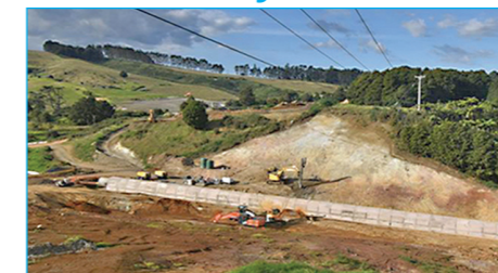
Matakii Reservoir construction site with main culvert in the background.

We signed a contract with Te Tai Tokerau Water Trust to purchase shares in the Kaikohe Water Company late in March. This will provide us with access to water in the Matakii Water storage reservoir. The contract gives Council preferential supply status ensuring we have a back-up supply for Kaikohe in case of severe water shortages. We are planning to install infrastructure linking the reservoir to the council water treatment plant by November 2022. Construction of the 750,000 cubic metre reservoir located north-east of Kaikohe is now at its mid-way point. Matakii will also provide water to the Ngāwhā Innovation and Enterprise Park and other local horticultural ventures. It will be operational by next summer.