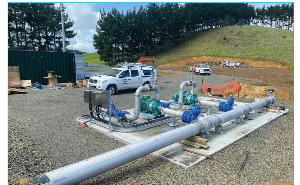
Final power and instrumentation work is now underway on the Sweetwater boreheads as final preparations are made to begin supplementing Kaitiāia water supplies.

A 14km water pipeline linking bores at Sweetwater to Kaitiāia's water treatment plant on Okahu Road is almost complete. The pipeline is a key component of our project to improve Kaitiāia's drought-resilience. This project is due for completion by June. Installation of power and instrumentation is ongoing at the bore site along with reinstatement and completion of bore headworks. A prefabricated pipe bridge is being lifted into place at Bonnetts Road and installation will be completed this month. The next phase of work is to connect the new bore water supply to the water treatment plant when further water testing and treatment processes can be calibrated. The Kaitiāia Water Project will enable the supply of an additional 5,000 cubic metres of water daily to Kaitiāia. The project's estimated total cost is $15.3 million and will provide safe, quality drinking water to Kaitiāia and supplement the existing supply from the Awanui River.