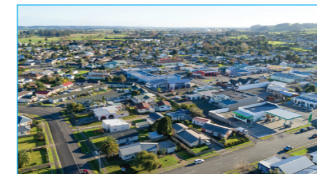
High-tech equipment is helping contractors to track down hard-to-find leaks in the Kaitiāia water supply.

Our Far North Waters contractors are achieving significant successes tracking down hard-to-find water leaks in our supply network and helping to save precious treated water. They've been deploying Aquascope and Zonescan 820 loggers that can distinguish the hiss of a leak from background noise to help pinpoint losses within the reticulation network. This technology is being deployed across the district but has already significantly reduced water leaks in Kaitiāia. In one instance, the highly sensitive equipment detected a leak within a concrete structure buried underground and completely hidden from view. This and other discoveries have resulted in a loss reduction of over 400 cubic metres of treated water per day.