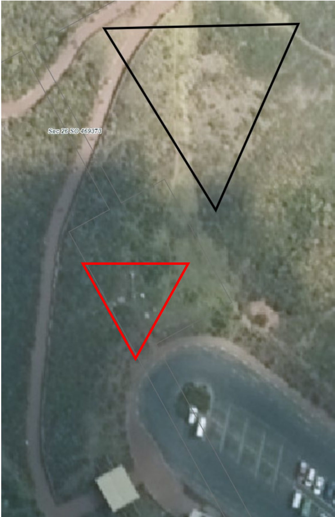
Figure 1: Cape Reinga Road AWS – black triangle identifying the MetService designation is incorrectly located and needs to be moved to the location of red triangle.