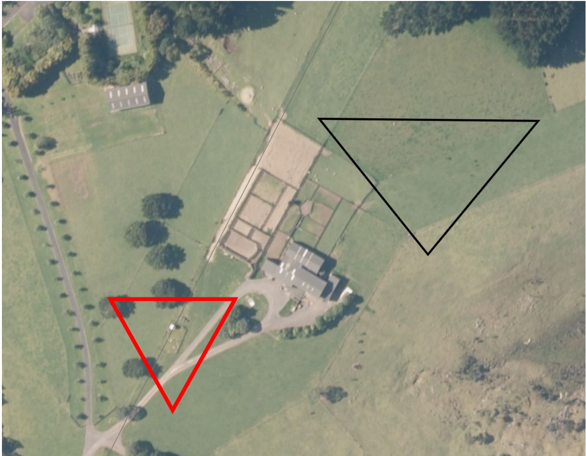
Figure 3: Paoneone Farm AWS – black triangle identifying the MetService designation is incorrectly located and needs to be moved to the location of red triangle.