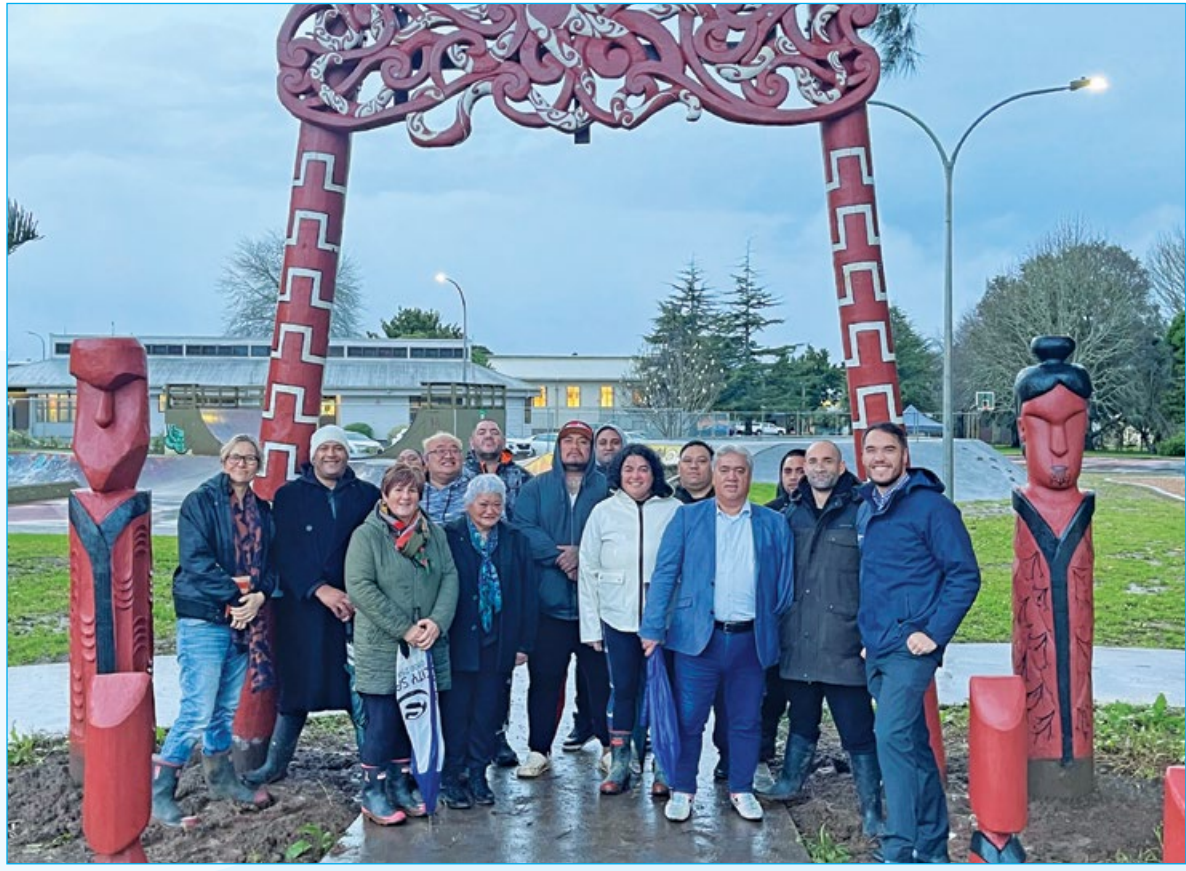
Local whānau, iwi, councillors and council staff were among those gathered to celebrate completion of upgrades to Kaikohe's Memorial Park.

Stage two shade sails are planned for Matthews Avenue Park in Kaitāia, Tauranga Bay in Te Hiku, Tōtara North, Cable Bay, Pukenui and Church Street in Kawakawa.