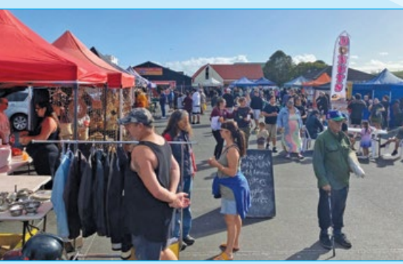
Kaitāia's Saturday market promotes local businesses and attracts visitor spending to the area.

Kaitāia's Saturday market will continue to be held at Melba Avenue carpark (the old Warehouse carpark) after the council approved the market's Licence to Occupy for another 12-month term.