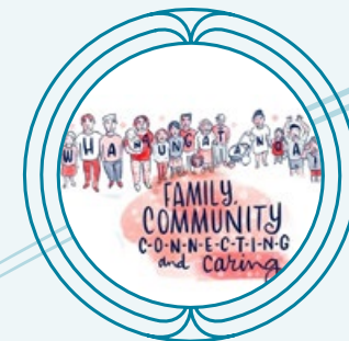
Whanaungatanga Family, community, connecting and sharing