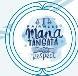
Mana tāngata Respect and fairness