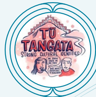
Tū tangata Strong cultural identities