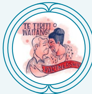
Te Tiriti o Waitangi Partnership

HE ARA TĀMATA CREATING GREAT PLACES Supporting our people