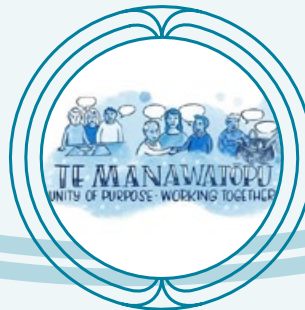
Manawatōpū Unity of purpose and working together