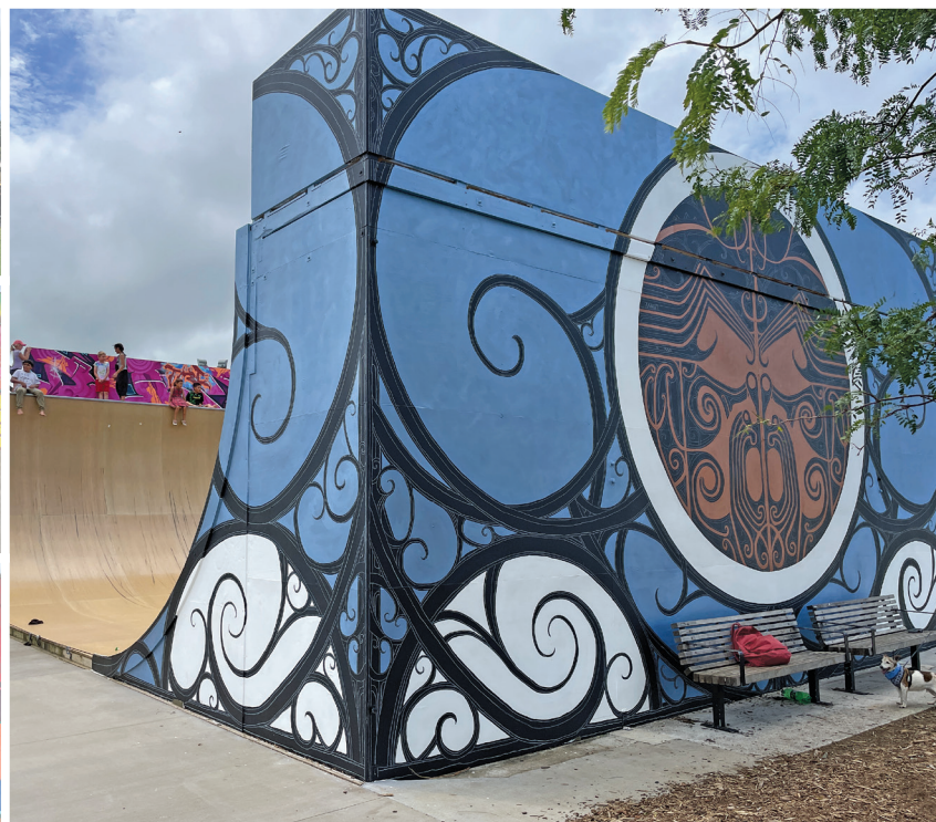
Kia Piki te Ora, greets visitors with a message of good health at the new skate ramp at Kerikeri Domain. Phase Two of the domain artworks includes a series of colourful messages encouraging strength, understanding and peace.