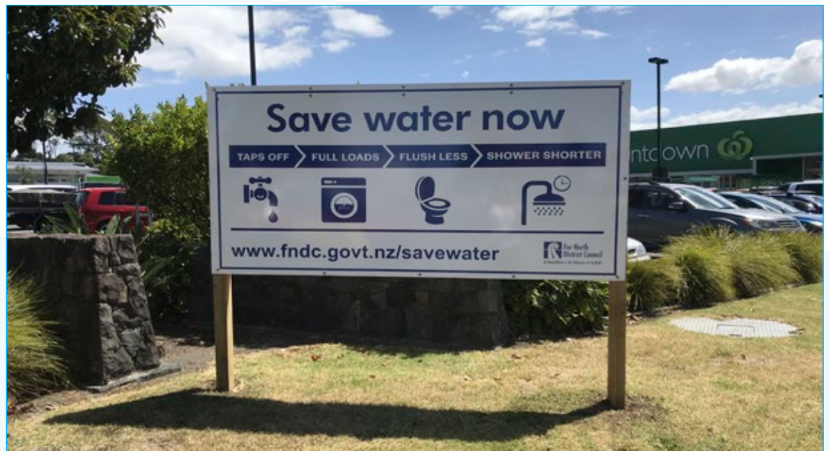
Level 2 water restrictions were applied to Kerikeri-Waipapa, Kaikohe-Ngāwhā, Paihia-Ōpua-Waitangi, and Ōpononi-Ōmāpere on Monday 19 February.

As a result of the change to Level 2 water restrictions, Far North residents will notice large Save Water Now signs have been installed in key locations around Kerikeri, Kaikohe and Paihia. Billboards at Ōpononi and