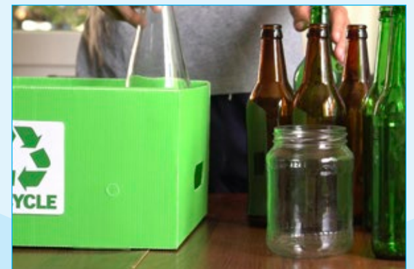
The council is already complying with new recycling guidelines.