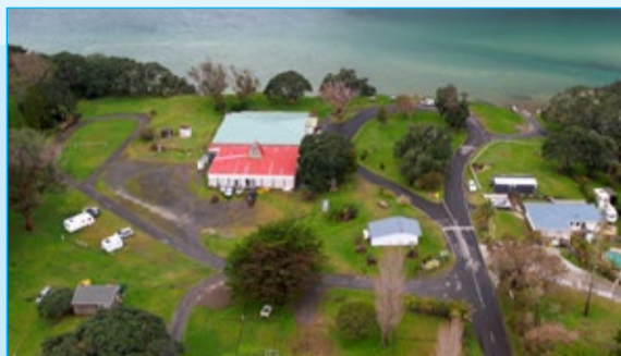
The walkway will link Houhora Heads campground to Pukenui.

Work is underway on a new gravel walkway from State Highway 1 just south of Pukenui, along Houhora Heads Road to the campground.