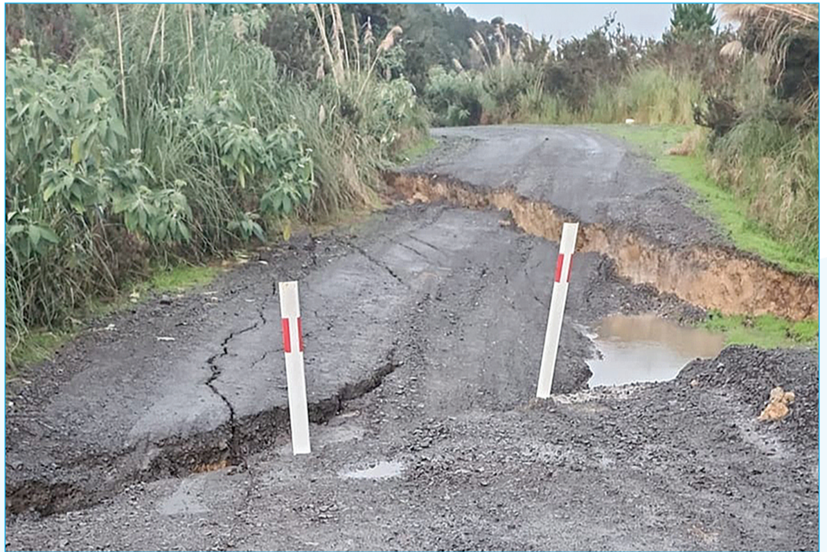
This serious drop out on Giles Road, Hōreke, is just one example of the damage recent weather has caused.

Unfortunately, gravel roads cannot be graded while it is raining as this would turn road surfaces to slush making them extremely unsafe. The advice to motorists is to drive carefully and always consider the conditions.