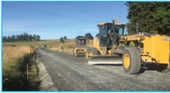
Sealing sections of road near homes and public facilities reduces the harmful impacts dust has on people's health.

Almost two-thirds of the Far North District's 2508km road network is unsealed. The Council doesn't have the funds to seal all unsealed roads, so we seal sections of a small number of our busiest, most densely populated roads to reduce the harmful impacts that dust has on nearby residents.