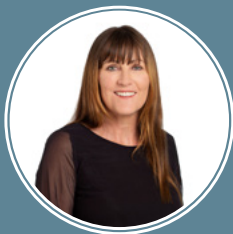
Cr Ann Court Deputy Mayor Bay of Islands- Whangaroa Ward