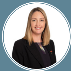
Cr Rachel Smith Bay of Islands- Whangaroa Ward