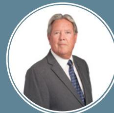
Lane Ayr Kerikeri