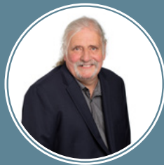
Louis Tooreburg South Hokianga