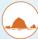
Resilient communities that are prepared for the unexpected