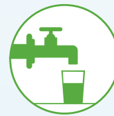
Protect our water supply