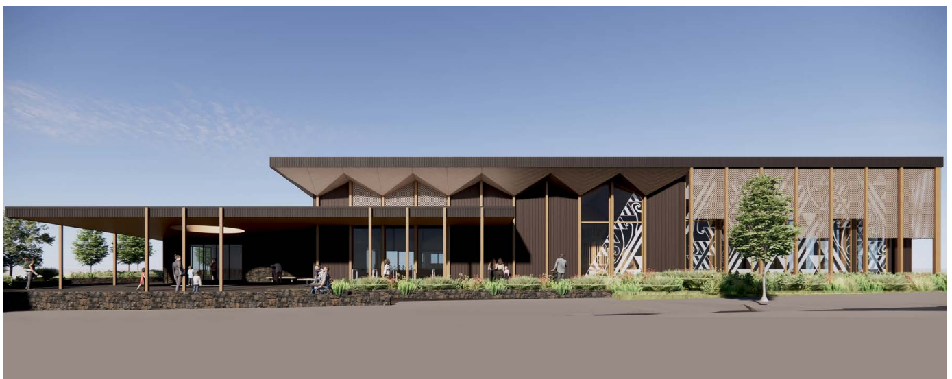
Side view of Te Āta Haere - Kaikohe Library and Civic Hub design