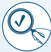
Better asset management