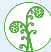
A wisely managed environment that recognises the role of tangata whenua as kaitiaki