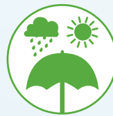
Adapt to climate change