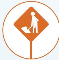
Repair our transport network