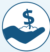
Enable sustainable economic development