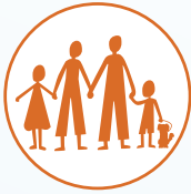
Ā iwi Social