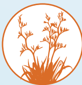
Proud, vibrant communities