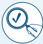
Better asset management